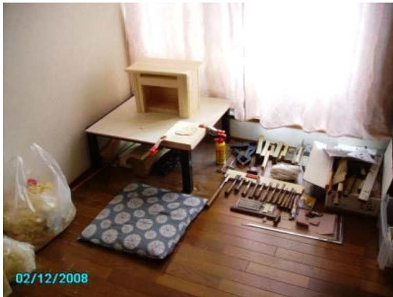
Photo of the 36 Square Feet Shop

I would recommend going for 10x18 if you do have more than 36 square feet of space.